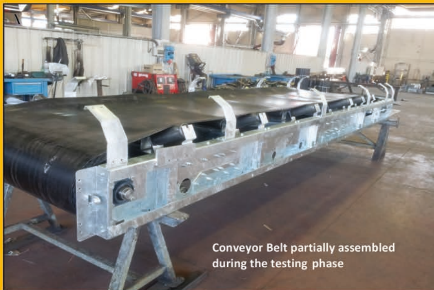
Conveyor Belt partially assembled during the testing phase

The Mod. NB Conveyor Belt is an innovative conveyor belt designed and built to be produced with industrialized systems, with exceptional qualities of simplicity, versatility and stoutness compared to the systems currently existing on the market. The multiple possibilities of combinations of its components allow the Mod. NB conveyor belt to be configured to meet the most different needs also ensuring, with a few simple operations, any changes or future reconfigurations. In fact, by adding or removing non-structural components, it is possible to change from the hollow belt system to the flat belt system on rolls and to the sliding/flat belt system and vice versa or even to the hybrid or mixed roll/sliding system, with the possibility to change its width. The versatility of use, the standardization of the product, the simplicity of assembly and the ease of maintenance and transport qualify this conveyor belt system with the highest price/quality ratio existing today on the market.