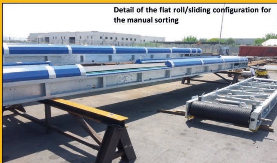
Detail of the flat roll/sliding configuration for the manual sorting

All the Mod. NB Conveyor Belts comply with the current Machinery Directives and are supplied with Identification Plate and Use and Maintenance Manual complete with CE marking.