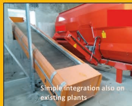
Simple integration also on existing plants